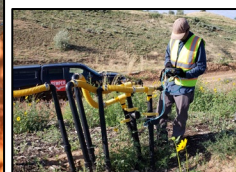
Landfill gas sampling