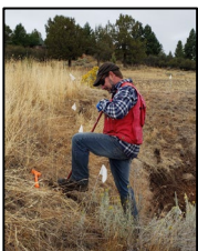
FUDS project, Oregon